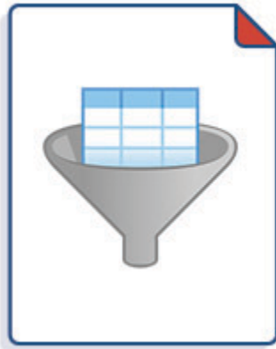
Table Filter macro allows you to filter any type of table data with the available set of filters. Different types of filters can help you filter records listings, financial reports, tables containing dates and media assets.