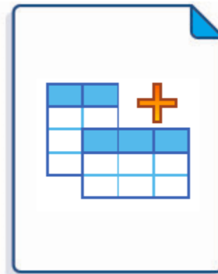
Table Transformer macro allows you to merge and transform all kinds of tables using both automatic presets and advanced SQL queries.